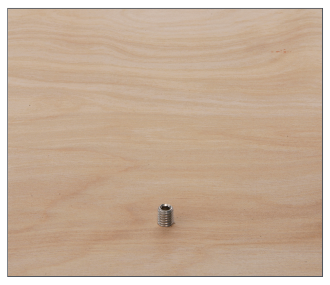
Set Fastener to Surface