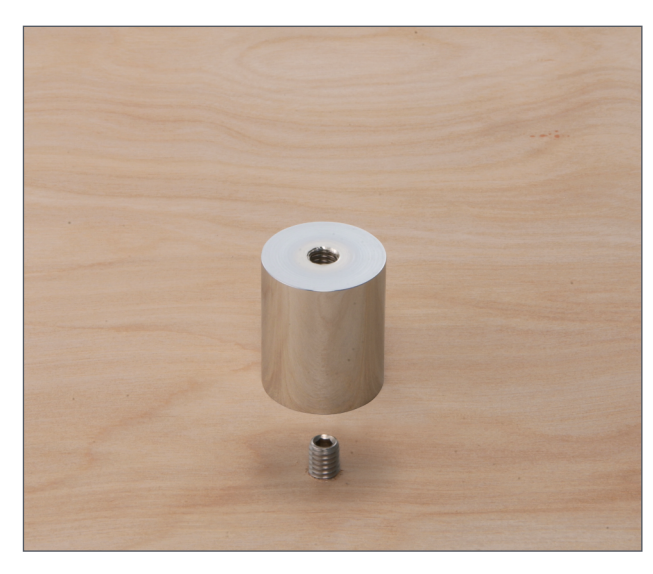
Thread Base Onto Fastener